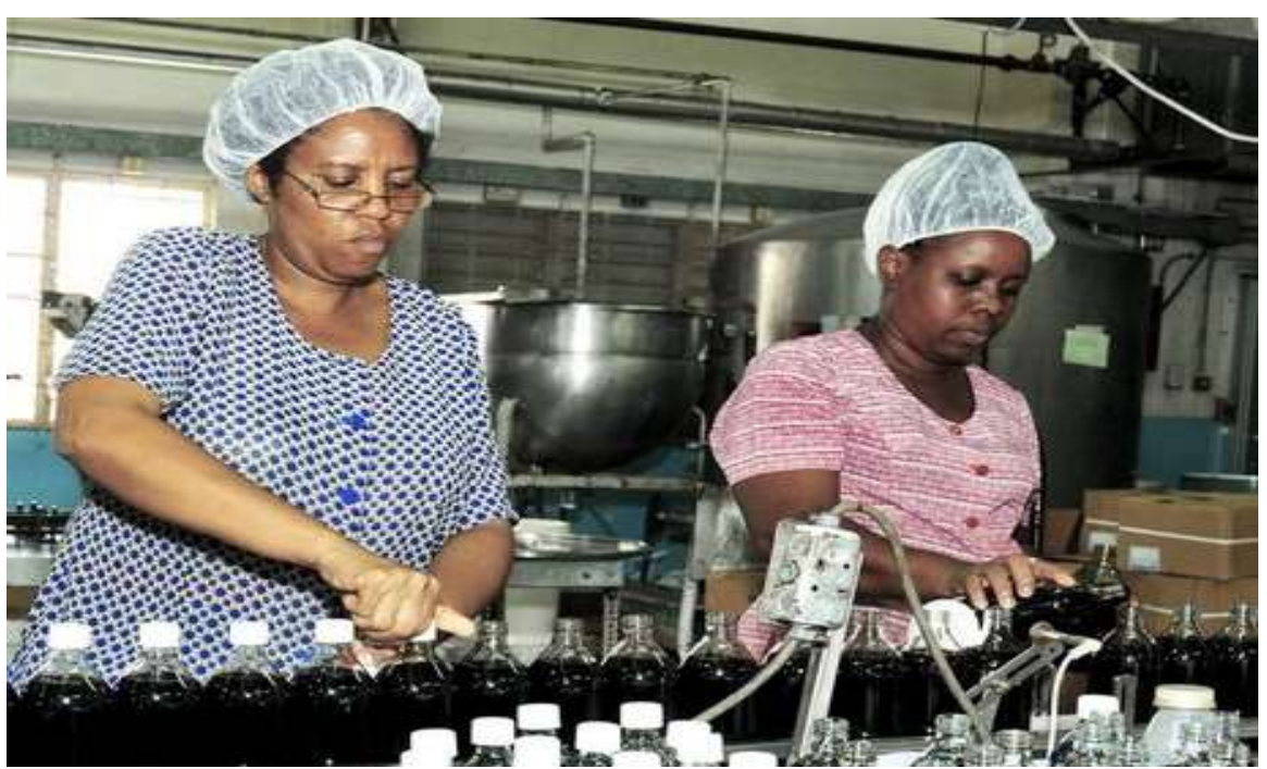
Figure 4: A Factory Production Line

Study Figure 4 which is a photograph showing a factory production line in Antigua and Barbuda and then answer the questions below.