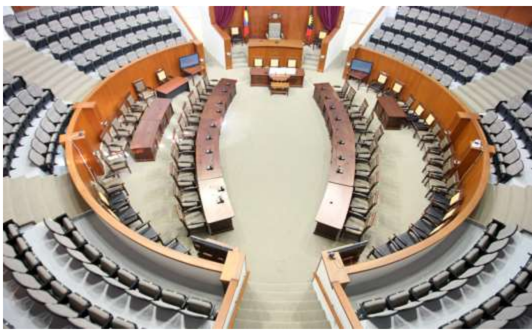
Figure 3: Parliament Chamber

Study Figure 3 which is a photograph showing the Parliament chamber and then answer the questions below.