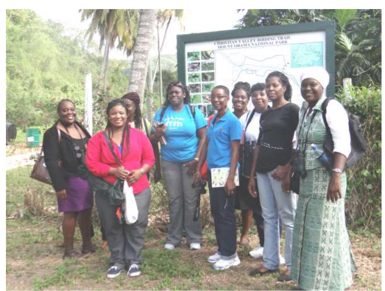
Figure 1: Teachers at Christian Valley Agricultural Station

Study Figure 1 which is a photograph showing teachers at Christian Valley Agricultural Station and then answer the questions below.