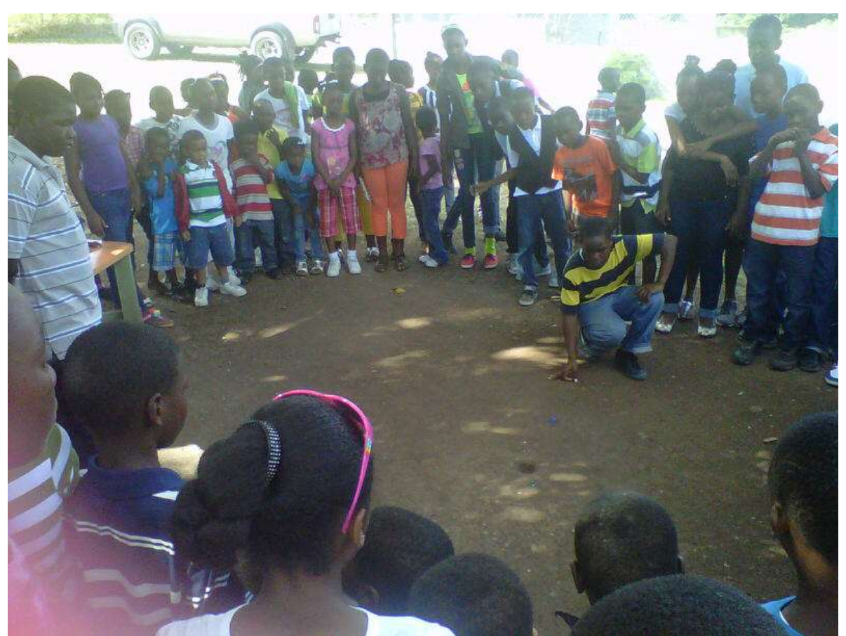
Figure 2: Students involved in a competition at a rural primary school

Study Figure 2 which is a photograph showing students involved in a competition at a rural primary school in Antigua.