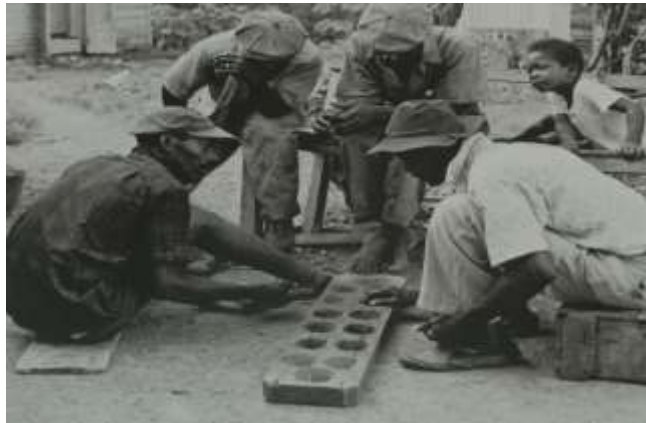
Figure 3: Men playing a board game

Study Figure 3 which is a photograph showing men playing a board game and then answer the questions below.