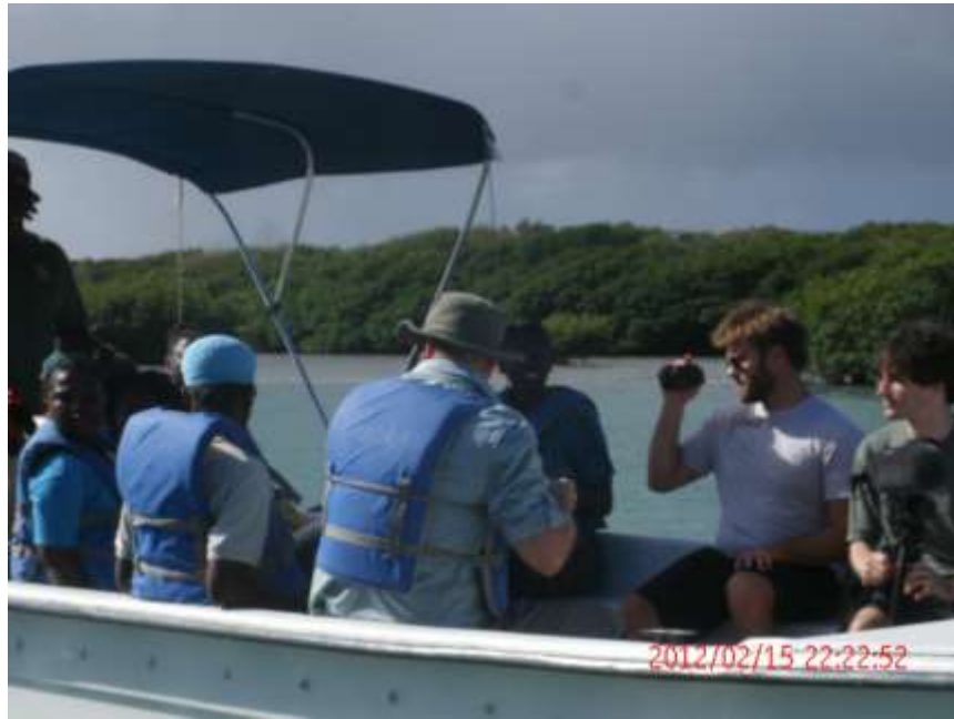
Figure 2: Tourists on a boating trip

Study Figure 2 which is a photograph showing tourists on a boating trip and then answer the questions below.