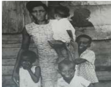
Figure 1: A woman and her children

Study Figure 1 which is a photograph showing a woman and her children and then answer the questions below.