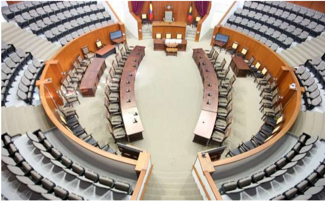
Figure 4: Parliament Chamber

Study Figure 4 which is a photograph showing the Parliament chamber and then answer the questions below.